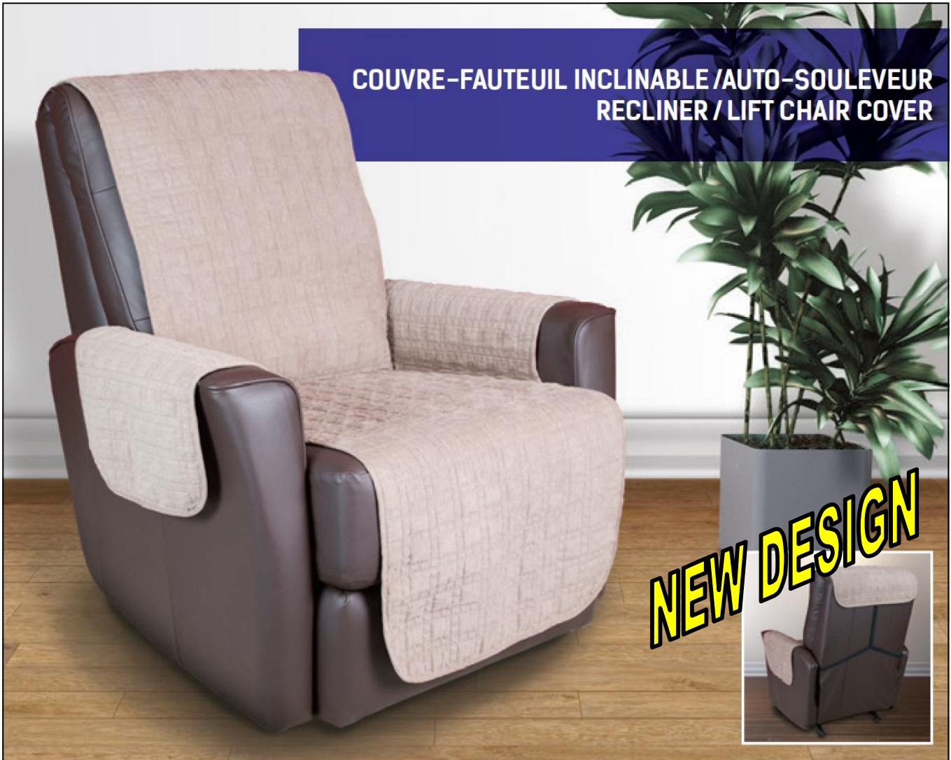
Item shown: RECOVERDESERT

WATERPROOF • Breathable • Quilted and ABSORBENT layer Elastic strips hold the cover in place • EASY CARE