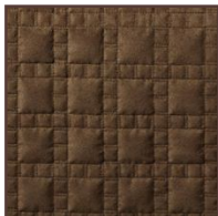
Chocolate brown Item # RECOVERCHOCO